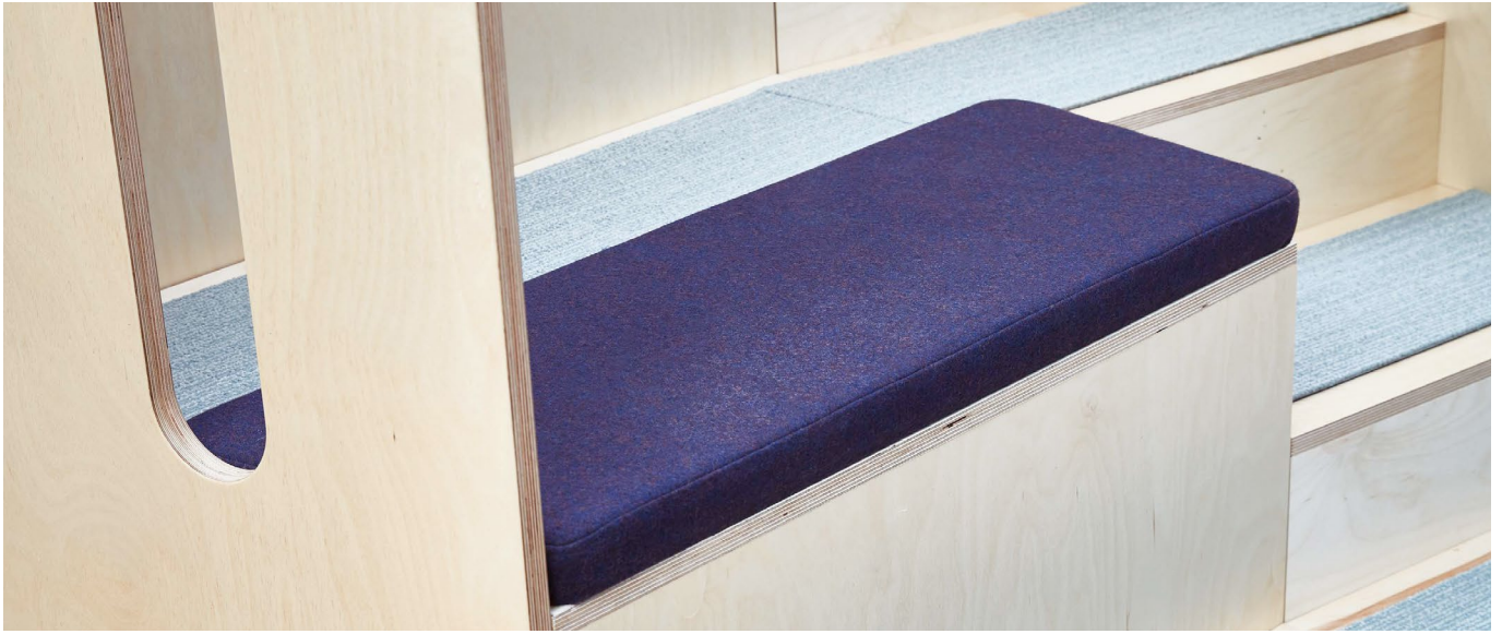
Seat cushions & floor covering