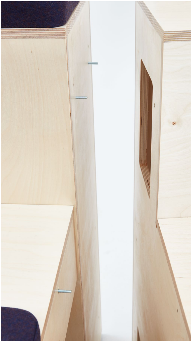
Simple On Site Assembly