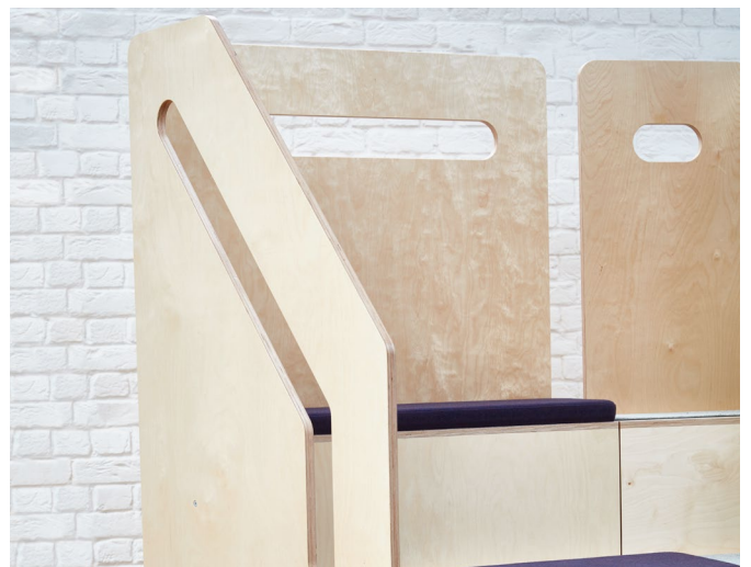
Back & Side Balustrades