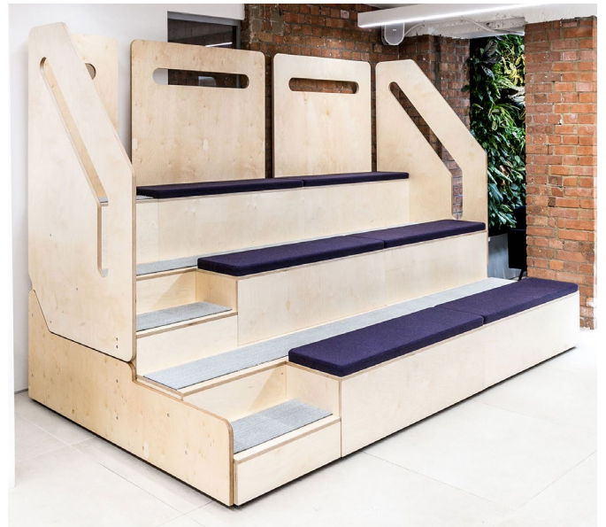
Birch Veneer Plywood Construction