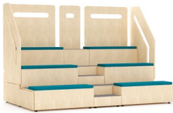
Configuration: 12 seat