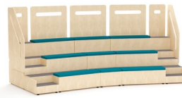
Configuration: 16 seat